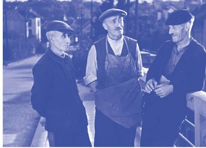
13. German-occupied France, whose territories were under the military and administrative control of Nazi Germany.