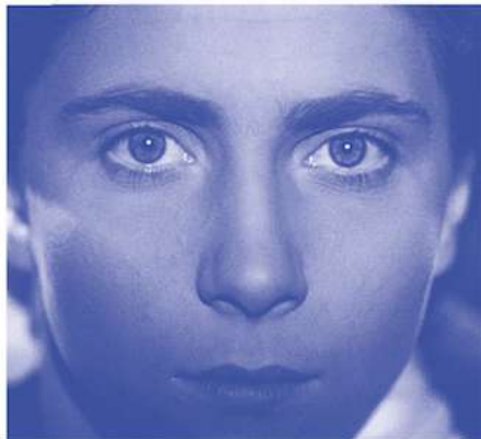
12. Beauty and the Beast, a French fairy tale written by Gabrielle-Suzanne Barbot de Villeneuve in 1740.

Don't you like that story? I've always loved it. I read it over and over. It made me cry. Especially the Beast, because I understood his suffering. Even today, I am moved talking about it.