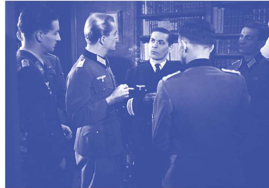
14. Nazi Germany, which controlled the territories of France under the rule of the National Socialist German Workers' Party (NSDAP).