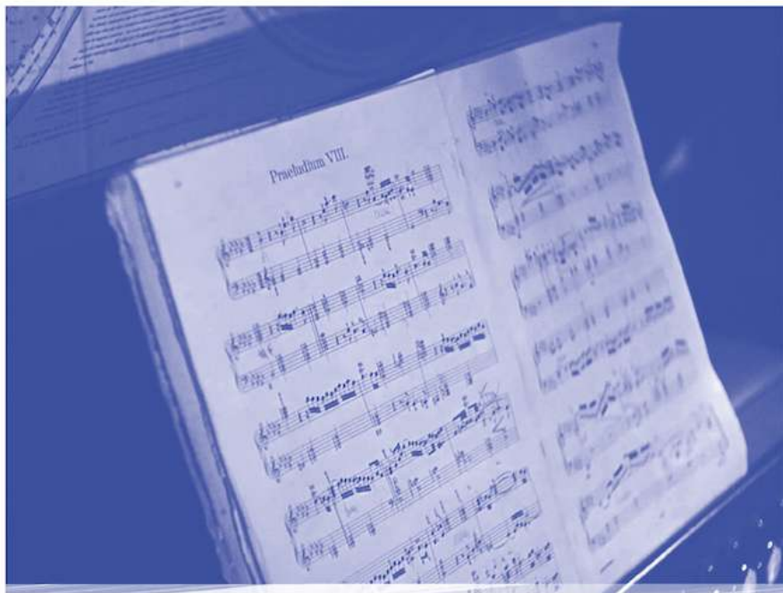
19. The eighth pair of preludes and fugues in the first book of The Well-Tempered Clavier by Johann Sebastian Bach.

20. The surrender of France, formalised by the Armistice of 22 June 1940 between Nazi Germany and the French Third Republic, following German's victory in the Battle of France, resulting in the establishment of a German occupation zone in northern and western France.